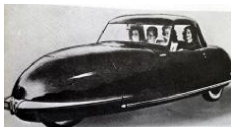
1948 "Davis" 3-wheeler, from USA, 2.2 litre engine.