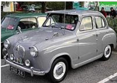
1954 Austin A30 Saloon