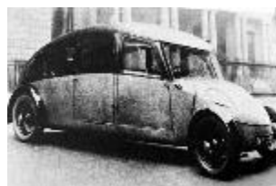
1928 "Burney" Streamline 7-seater, Berkshire UK, rear Alvis engine, 12 made.