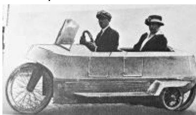
1923 "Atlantic" car, from Berlin, with air-cooled 2-cyl engine. No other info.