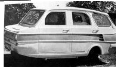
1980 "Badger" from Wisconsin USA, only 10 made.