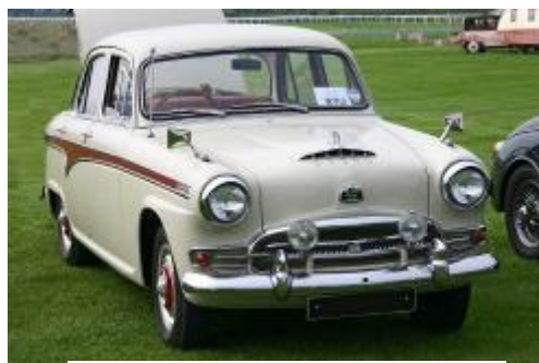
Austin A95 Westminster