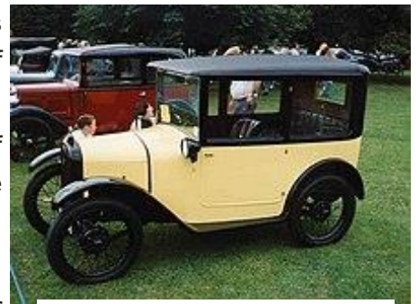
1926 Austin Seven Saloon

After WW1 the Austin company continued to build a whole range of cars and trucks to meet the ever growing market. When WW2 broke out Lord Austin again offered his services to the nation but sadly died in 1941 ending a remarkable life.