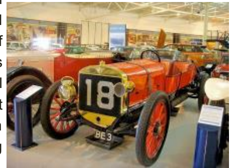
1908 Austin 100hp Grand Prix car

Back in UK after 15 years in Australia this obviously very talented man set up a company.to design and manufacture motor cars and he called it the Austin Car Company. He went on to produce a vast array of vehicles and engines for the war effort in 1914 and contributed his organizational skills to help the Government to build a huge industrial force. The Austins lost their only son in 1915 in WW1. In 1917 Herbert Austin was knighted for his services to UK becoming The Baron Austin and joined the British Parliament in 1919 but resigned in 1925 saying that "men of business like myself can achieve more for Britain outside Parliament than in it.". The first of the famous "Baby Austins" appeared in 1922 and each year he reduced the price and a few years later he was selling a range of large luxury sedans to the top end of the market