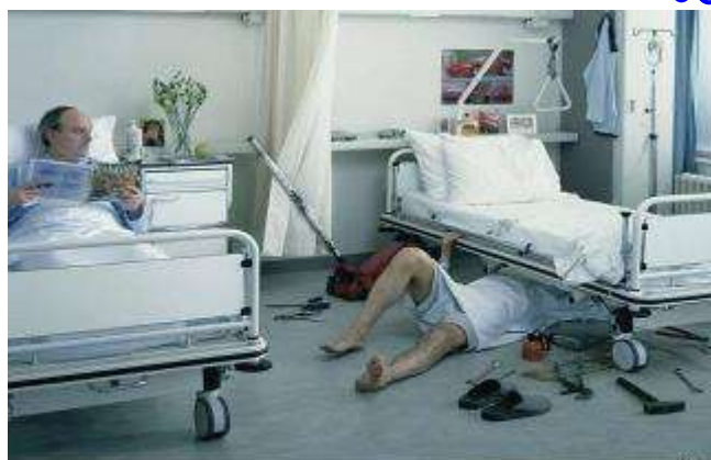
What happens when Old Car Guys get sent to a nursing home ...