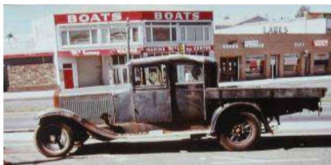
Tray truck used by Bert Grierson with modified cabin to include back seat