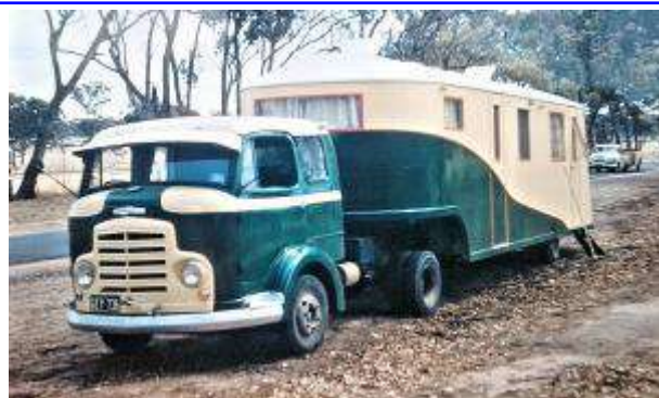
The Commer and homemade caravan Grierson family use in mid 1950's to tour outback Australia