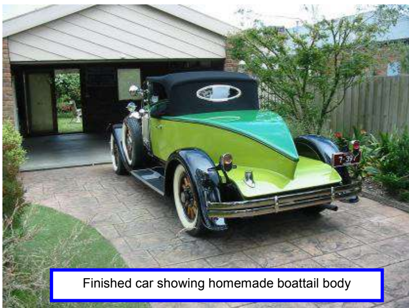
Finished car showing homemade boattail body