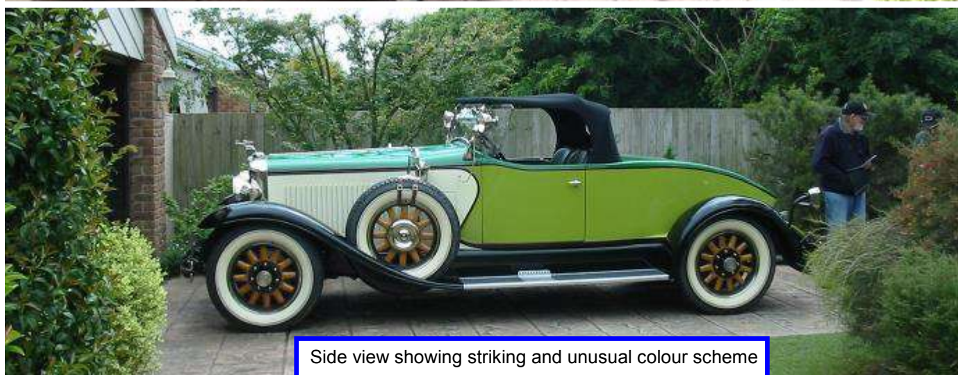
Side view showing striking and unusual colour scheme