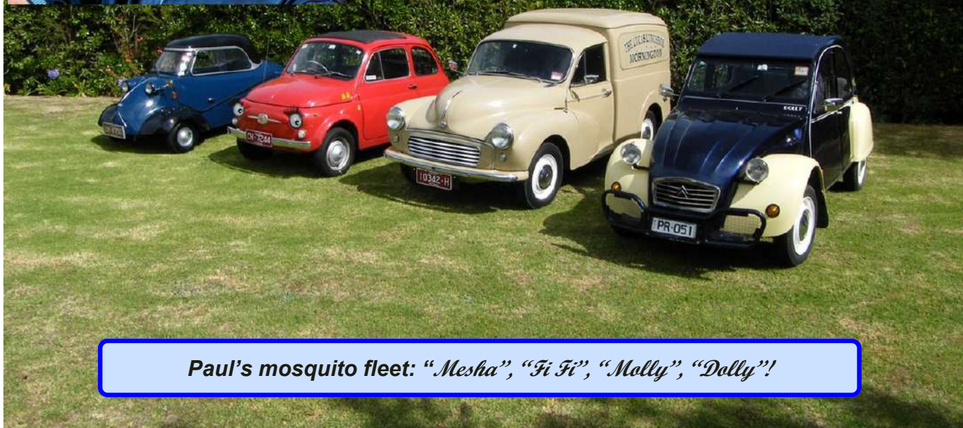
Paul's mosquito fleet: "Mesha", "Fi Fi", "Molly", "Dolly"!