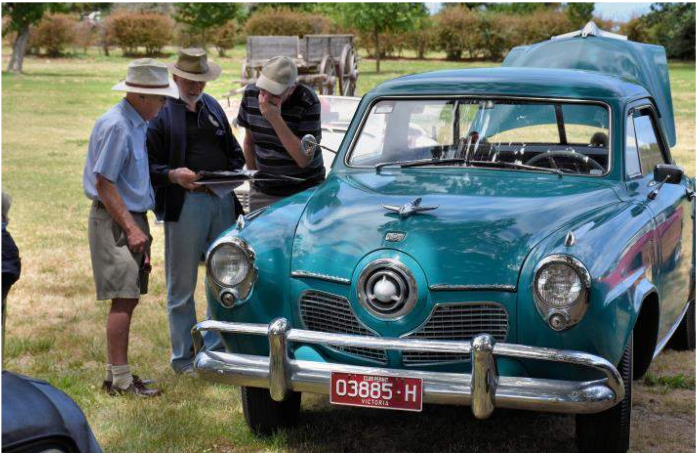
Three Wise Men and a Very nice Studebaker on New Years Day

The views and/or opinions expressed in CRANKHANDLE are not necessarily those held by the Committee of the SPC&HCC.